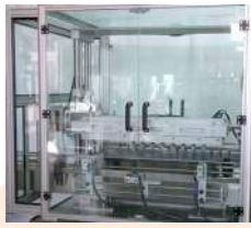
機台安全外罩 Machine safety cover